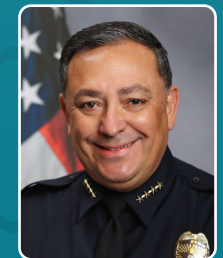
Art Acevedo Interim Police Chief